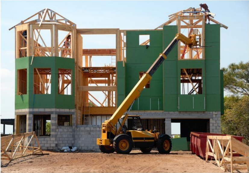
Real Estate Investments